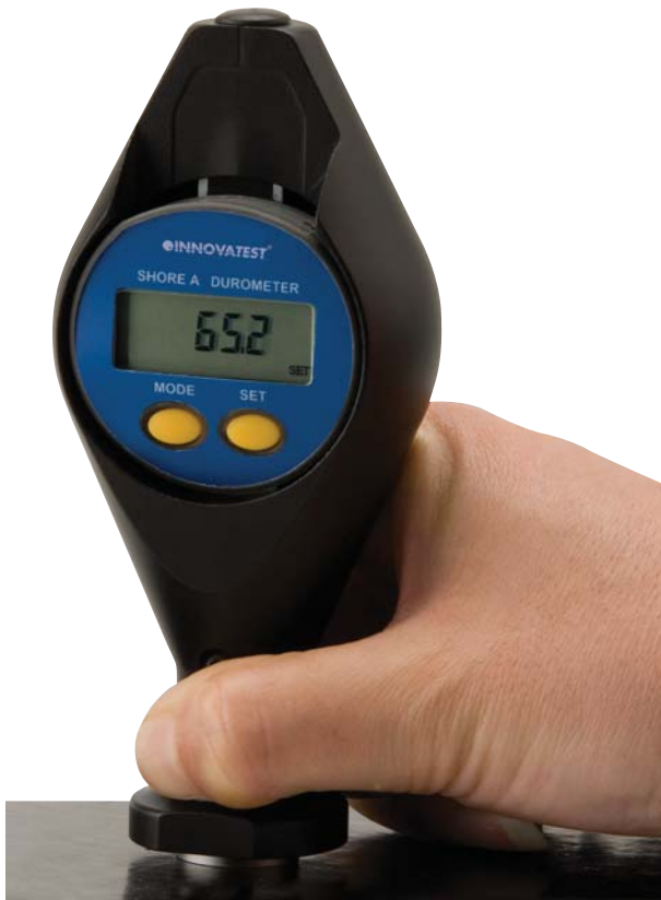
DSAS001 SHORE "A" TESTER