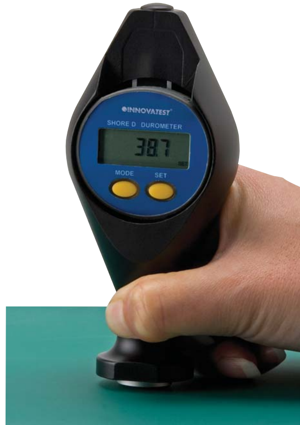
DSDS001 SHORE "D" TESTER